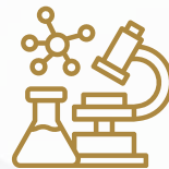
Hall 3: Laboratory