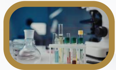
DIAGNOSTICS & LABORATORY