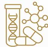
Hall 4: Pharmaceuticals