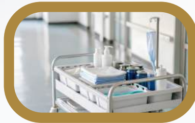
HOSPITAL INFRASTRUCTURE & SUPPLIES