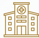
Hall 2: Equipment & Hospitals