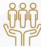
Hall 1: Consumables & Entities