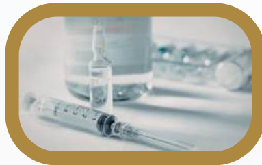
PHARMACEUTICALS & DISPOSABLES