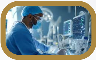
MEDICAL DEVICES & EQUIPMENT