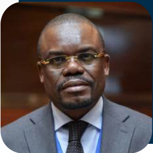
H.E. Dr. Jean Kaseya

"Africa Health ExCon serves as a pivotal catalyst, driving the future of healthcare innovation and investment. It is the premier platform for uniting stakeholders to build resilient health systems and accelerate progress towards universal health coverage on our continent."