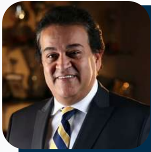
H.E. Dr. Khaled Abdel Ghaffar

Deputy Prime Minister, Minister of Health & Population of Egypt